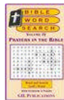
Volume IV: Prayers in the Bible