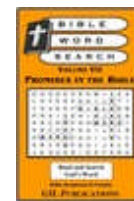
Volume VII: Promises in the Bible