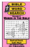
Volume II: Women in the Bible