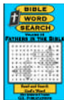
Volume III: Fathers in the Bible