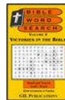
Volume V: Victories in the Bible