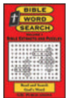
Volume I: Bible Extracts

But Elizabeth said, "No! His name is John !" . . .