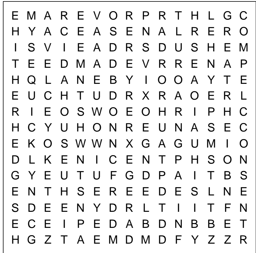
Copyright 2008 © GIL PUBLICATIONS, www.BibleWordSearchPuzzles.com

For I say unto you, That none of those men which were bidden shall taste of my supper.