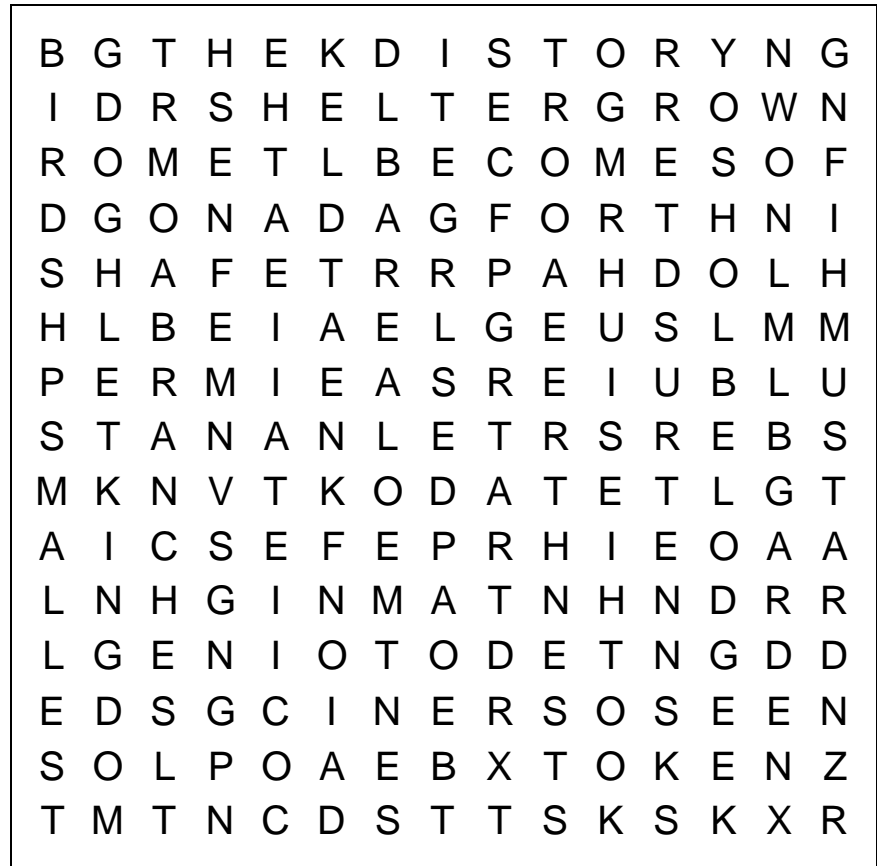
Copyright 2008 © GIL PUBLICATIONS, www.BibleWordSearchPuzzles.com

Of all the seeds it is the smallest , but when it has grown it is the largest of the garden herbs and becomes a tree , so that the birds of the air come and find shelter in its branches .